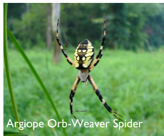
Argiope Orb-Weaver Spider

(family Araneidae) large, often colorful spiders that create iconic circular webs. Look for hundreds (sometimes thousands) of