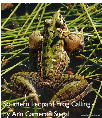
Southern Leopard Frog Calling - by Ann Cameron Siegal

their webs on fall mornings along the boardwalk and throughout the wetland. Young spiderlings often engage in clustering behavior for warmth and protection, then use their silk as parachutes for aerial dispersal, sometimes floating for hundreds of miles on wind currents. Miniscule eight-legged explorers have landed on