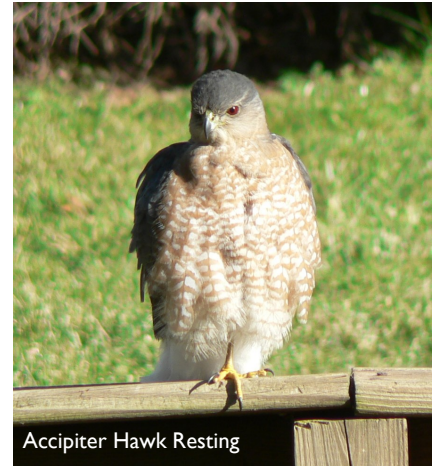
Accipiter Hawk Resting

Perhaps the least flashy (certainly the smallest), Waggoner's Gap may be the best site for consistently great looks at many species, and it's close enough to be a day-trip. A small parking lot, single port-a-john, one sign and a short trail leading to a pile of boulders is all we're talking about, but that pile of boulders overlooks a PA mountain ridge and valley – sit here for several hours (dress VERY warmly!), and watch as Hawks, Falcons, and Eagles fly almost at eye-level. No facilities or trails, but it's perfect for birders looking for great looks at many species just 2 hours from D.C.