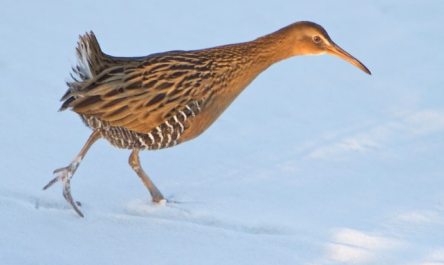
King Rail

been noted. Are they just passing through, or will we be seeing their young this year too? Additionally, we have been watching a Pied Billed Grebe which flew into the