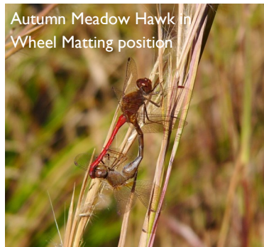
Autumn Meadow Hawk in Wheel Matting position